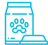
Animal & Pet food