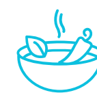
Spices & other