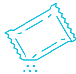
Powder & Granules