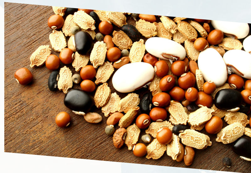
• SEEDS AND NUTS