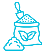
Fertilizers & Chemicals