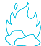
Charcoal & Sand