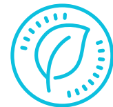
Bird food & other