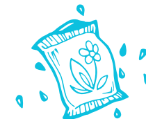
Seeds & Ingredients