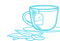
Tea & Coffee