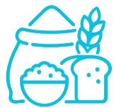
Grains & Pulses

We are backed by a talented team of professionals, which helped us in catering to the growing demands of our valued clients in a most efficient manner. Our personal work in close coordination with each other as well as with the customers to maintain a friendly environment in the organization so as to serve the clients with their exact demands.