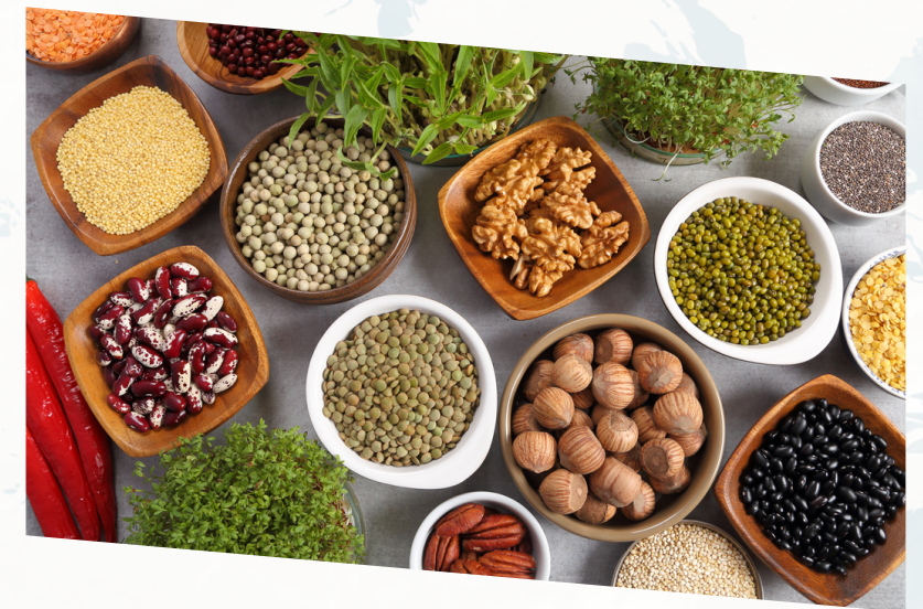
• ORGANIC FOODS