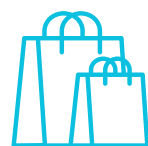
Outer & Paper Bags